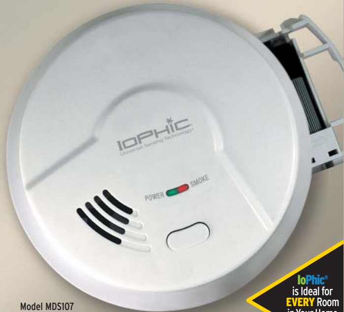
Model MDS107 Model MDS300

IoPhic® is Ideal for EVERY Room in Your Home