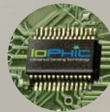
PATENT PENDING MicroProcessor

The First Single Sensor Alarm to Respond 87% Faster* to Slow Smoldering Fires & Respond Quickly to Fast Flaming Fires